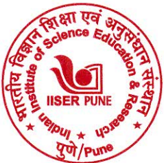
Chairman Board of Governors

Given under the seal of the institute on Friday, the 19 th of May, 2017